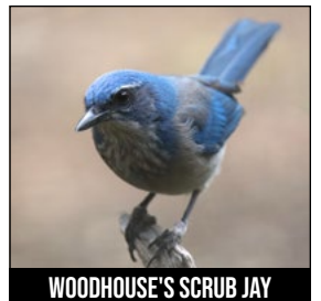
WOODHOUSE'S SCRUB JAY