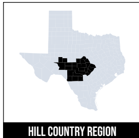
HILL COUNTRY REGION